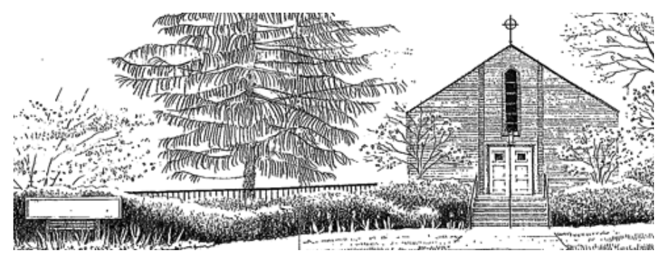
Drawing by Jon Hlafter